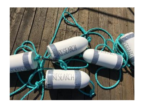
Surface floats on the research gear.

For questions or lost and found research gear, please contact: